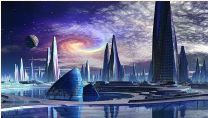
Site of last year's Homecoming

Presentation is not necessary – many choose to participate in the event without presenting – but it is highly encouraged if you have even an inkling of interest. We love hearing from everyone in the circle and find the energy flows, builds, and spirals upward ever so intensely and beautifully when seekers bring something to the table.